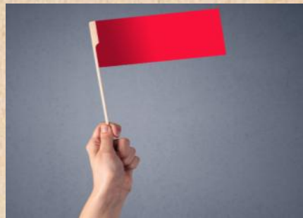
Since Charter Nite, i.e., April May and June, the club has had only 2 sessions

There is a saying in English " We can get a horse to the lake but we can't make it drink the water". So whatever the interest we are talking about should sprout from within the individual. All these toils won't make any difference without the cooperation from the individual himself.